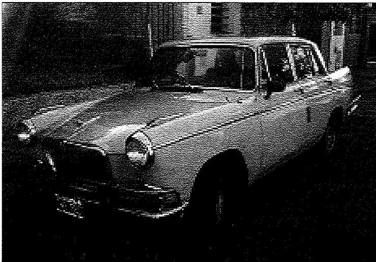
A Magnette in clean condition built for IKA Industries seen parked in Buenos Aires.

Quilmes, Provincia de Buenos Aires, Republica Argentina.