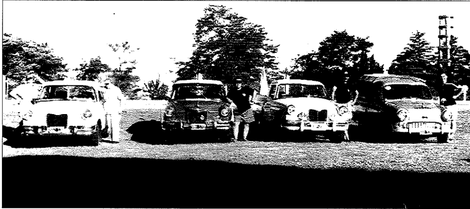
Argentinian Farina line-up including Argenta Pick-up and early pick-up based on A55, as well as two Di Tella 1500s (Riley based fronts).