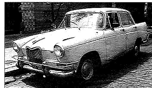
Siam Di Tella 1500

Car scrapped: 4/72, chassis 23939, KTC758F. Owner: S. McGeorge, Sale, Cheshire, England.