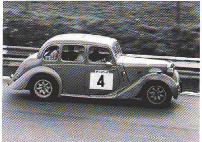
The author practising what he preaches with his 1350cc supercharged Y-Type, at Mallory Park last year.