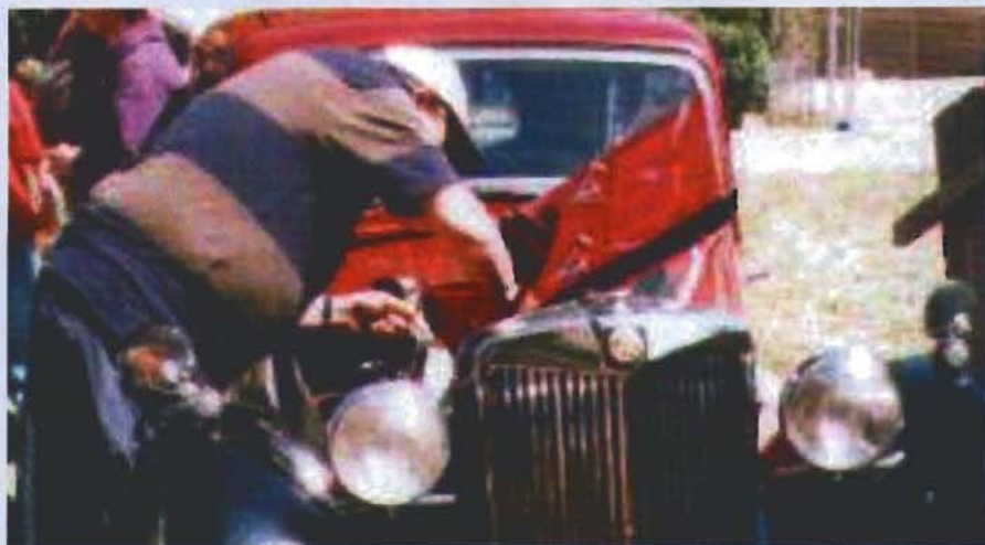
Comin McLachlan tinkling under the bonnet of his Y Type

No visit to Oz is complete without a 'barbi' and Alf and his band of helpers came up trumps. A total of 18 cars, ( 6 Ys, 1 MGB GT and 1 ZA) adorned the lawns in front of Alf's house, quite a concours of elegance. The afternoon passed too quickly with a great