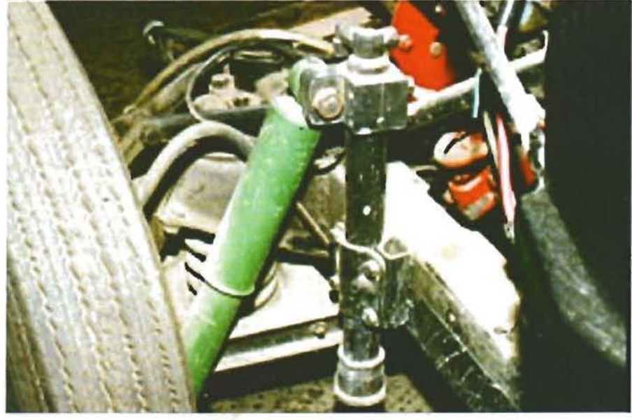
Shock absorber modification