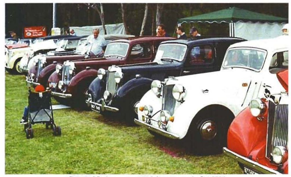
Group of Sydney cars at a club concours in Oct 2004

held in the state capital. Generally they are held in a nearby centre, away from the problems of the larger cities.