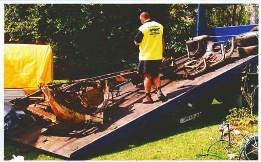
Y sedan on route back to God, left in the open for 30 years

have maintained a regular correspondence with Dennis over the years and the file I have kept of our writings is now quite voluminous. In September 2003 we had the pleasure of meeting him and the