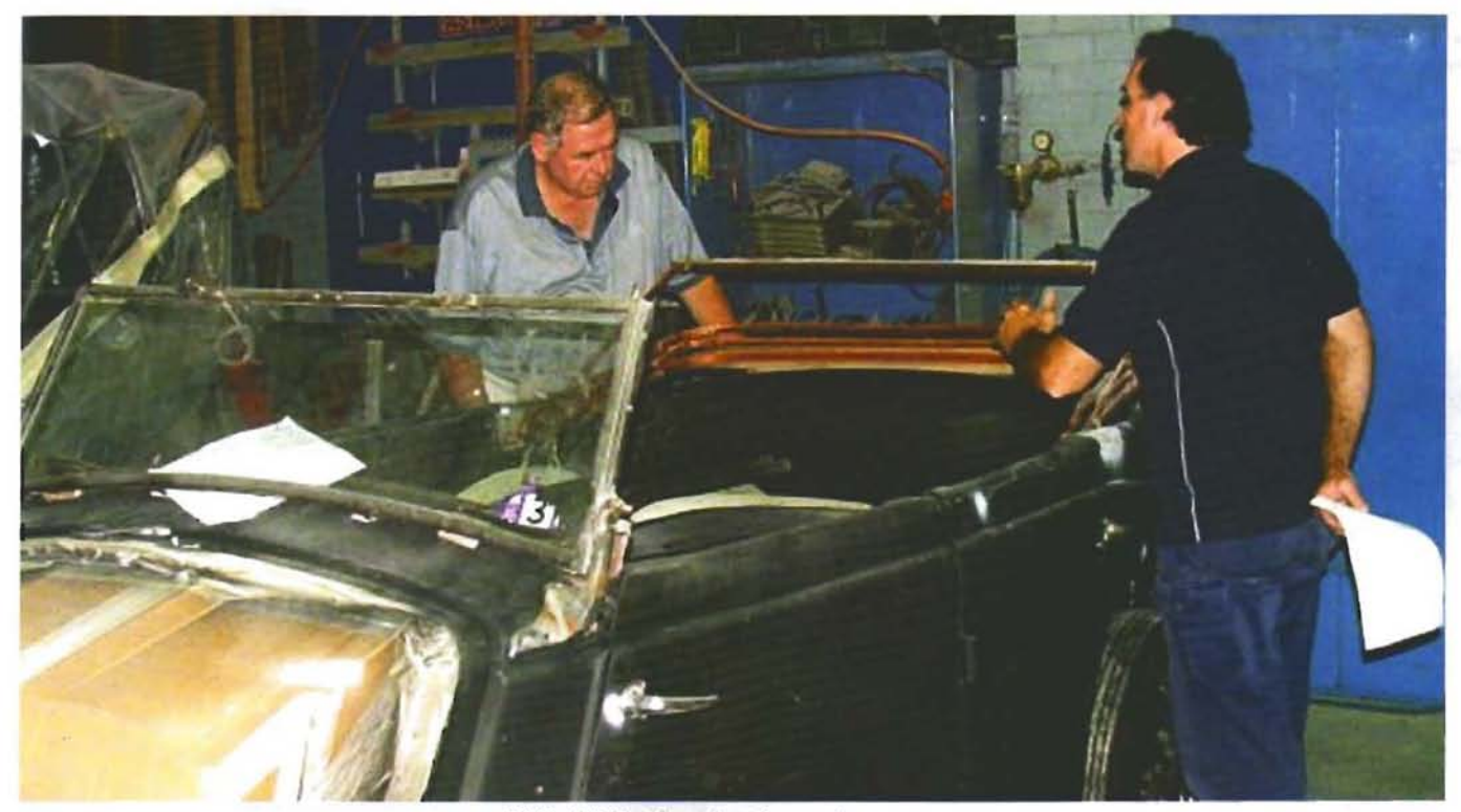
header tank and the gauge is useless.

To overcome this difficulty readers might care to check out the article on the web site which details a radiator overflow system, where coolant is retained by means of what is essentially a 'sealed' system.