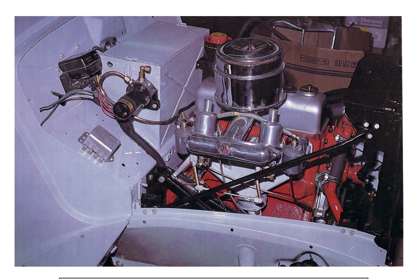
Originally published in MG Publications Abingdon Classics, November 1984