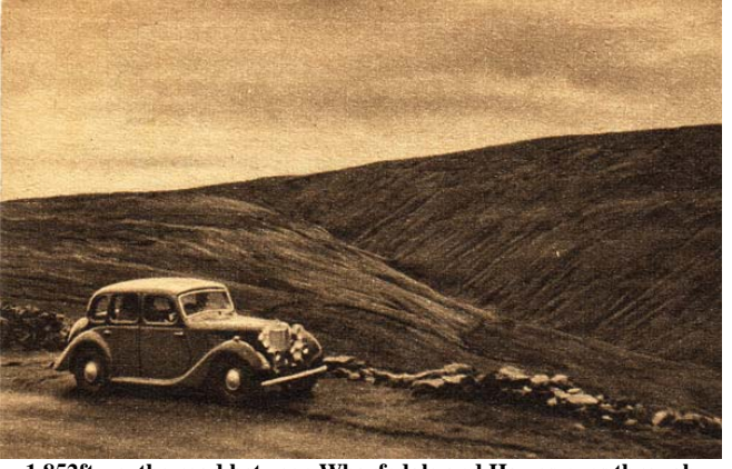
1,852ft up, the road between Wharfedale and Hawes runs through some magnificent scenery