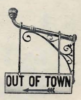
Originally printed in the Autocar 21 July 1950.