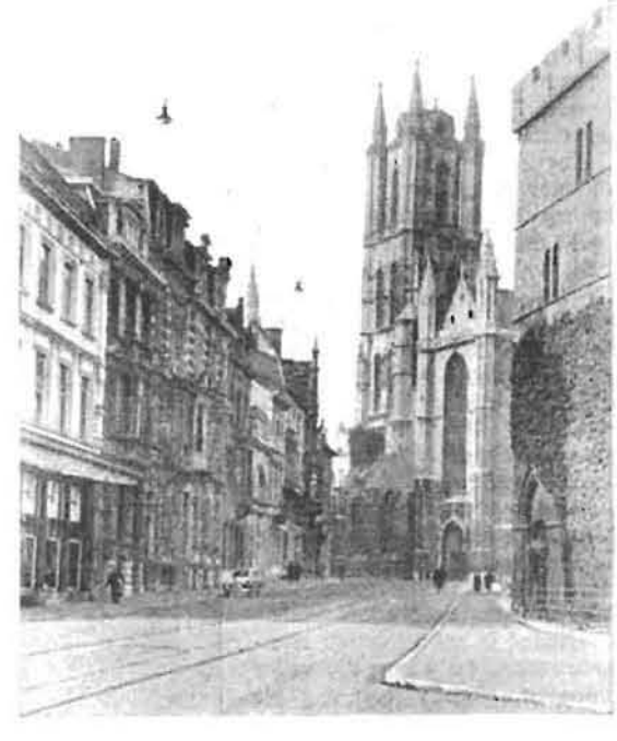
FLEMISH SURVIVOR.—The mediæval city or Ghent is a magnificent reminder of the commercial importance of Flanders in days past.

The northern hills of the Ardennes, to which Liege is the gateway, are rolling and thickly clad in pinewoods It is a pleasant countryside and the roads generally are good outside wardamaged areas, even if devious and lacking in signposts-an unusual complaint in Belgium, but perhaps deliberate in a district which bitter experience has shown to be sadly open to invasion The principal resort in the area is Spa, known in motoring circles for its proximity to the Grand Prix circuit, a valley town well provided with hotels which has been lucky enough to escape major war damage. Malmedy, a little farther east, has been less fortunate, the towns and roads having suffered considerably, while nearer the German frontier