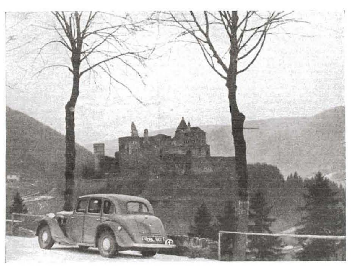
FRONTIER GUARDIAN.—Towering above the rooftops of the village, the Chateau de Vianden looks out from the Grand Duchy of Luxembourg across the river to Germany.