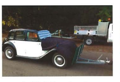
Gavin's A-Frame in action

Sunday morning's first 21 mile drive took the Y's to their first stop at the Blackall Range Horseless Carriage Club in Maleny, where the Club's members had a display of their vehicles and put on a very large spread of sandwiches, cakes and other treats for our morning tea.