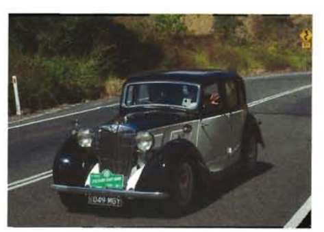
Gavin & Rayleen in YA3530

Straight after lunch at Palmwoods, the convoy headed to a secret location where the now 33 Y-Types formed a large "Y" for the official event photo of the weekend. Our 34th Y-Type, a Tourer, failed to make it to Nambour and was returned to the Gold Coast for a rest and new expansion plug!It was quite an experience, lining up all the cars, matching colours where possible and getting all the crews in place – but boy oh boy, it was worth it.