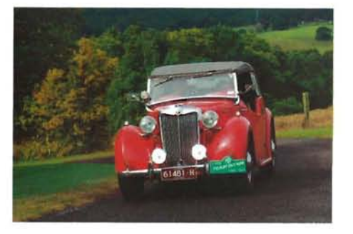
Furthest Driven -Robert & Louise in YT3706

They also had to try to guess an MG Y part sewn inside a sealed cloth bag. All items were small parts and unique to Y types – both the Saloons and Tourers!. Many a puzzled look was observed, and even the "experts" had a go in identifying the "mYsterY part".