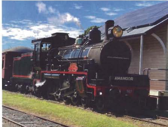
Trains and Automobiles

On a beautiful sunshiny day, we arrived at the Coolum showroom of the Sir Henry Royce Foundation and Carroll's Transport Depot. The showroom was a demonstration of a passion for cars merged with engineering excellence from a bygone era that still influenced modern day transport. From there, we drove to the shores of Lake Cootharaba, through the lush green scenery of the Mary Valley, with the flooded gums, turpentine trees and native lasiandras still glistening from the recent rain. The cars were positioned in front of the renowned Appolonian Hotel against a clear blue sky with wispy cloud formations. They portrayed a shiny spectacle from the past attracting the curiosity of passers-by. We left in a cavalcade journeying through more beautiful vistas of green pastures and dairy cows against volcanic mountain remnants en route to another historic cultural experience to view a silent film at the Majestic Theatre in Pomona.