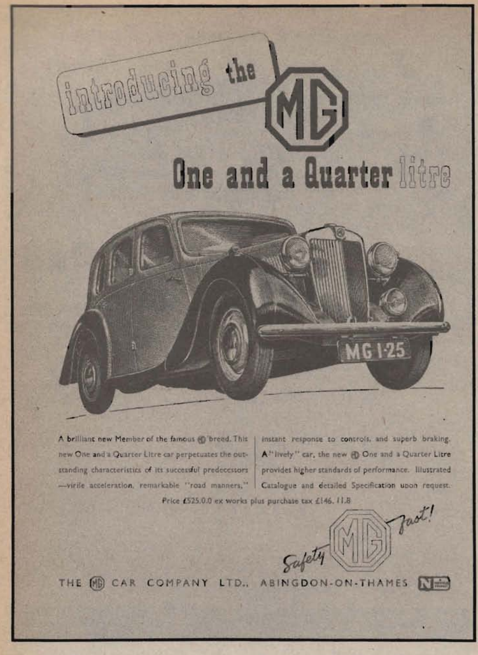
The Y-type sedan, already obsolete at the time of its 1947 introduction.

of 22 seconds and 83mph top speed combined with fine road manners to create what Tom McCahill described as "a low calorie Ferrari". In slightly less graphic language The Autocar (April 15, 1955) concurred with this view, observing "the road holding of this car... is remarkable indeed."