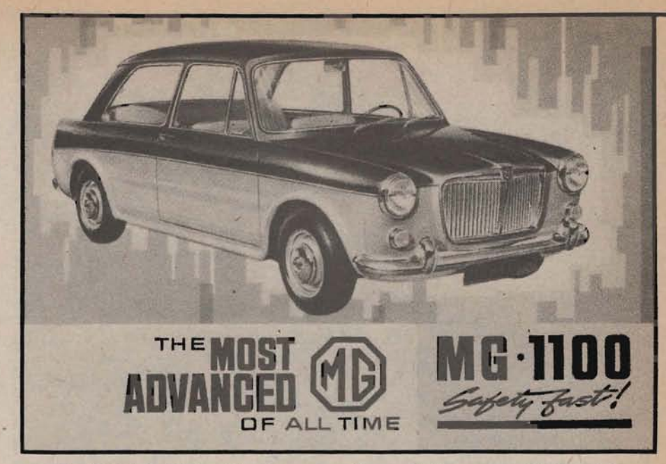
The 1963 MG 1100, with a transverse four-cylinder engine, FWD and front disc brakes.

What a pity! A great name and a grand design flawed and mained by a modern version of the old kingdom being lost by the lack of a nail theme. British Motor Holdings, BMC's successor, later tried to salvage its shrinking portion of the U.S. small car market with a revised version of the MG1100 known as the Austin America. But having fumbled its best shot with the MG Sports Sedan, BMH's success with the Austin in the face of the continued strength of Volkswagen and the growing presence of the Japanese in the American market was limited.