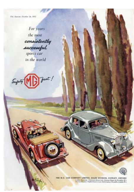
Period illustration showed MG with a pre-war style that lasted up to when the ZA Magnette replaced the range