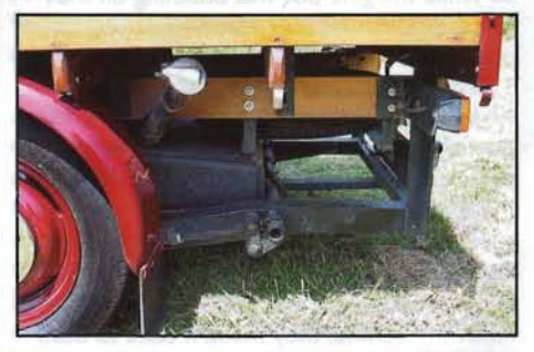
This view gives you an idea of the strength of the conversion - and the ingenuity involved.