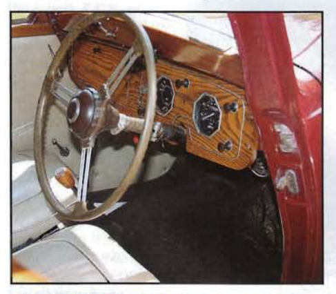
above most of the opposition.

Entry into the cabin is easy through the