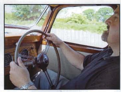
Life at the wheel is a mixture of utilitarian convenience and luxury.