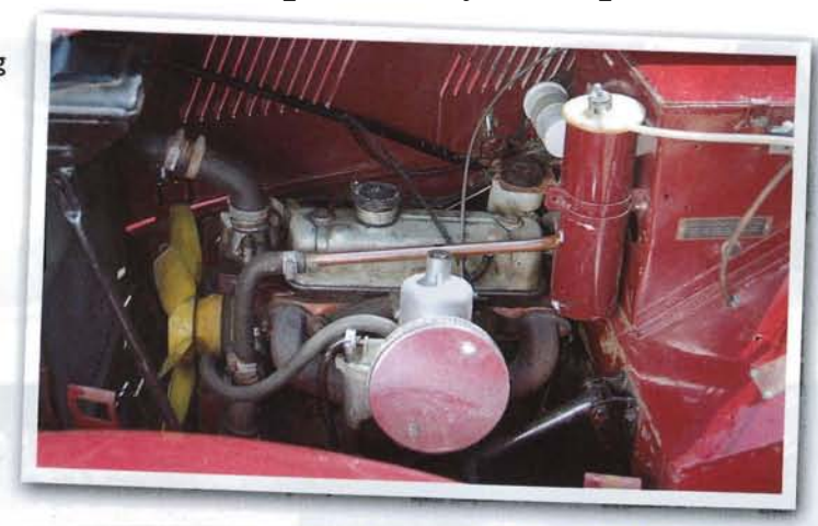
Yes, it's a good old A-Series 1275cc engine from a Marina. It provides a bit more zip than the standard XPAG unit.

I know of one car in Holland with a crane in the back, but I've never seen another Y-Type pick-up, even from Australia. Enthusiasts know that MG never made pick-ups, so they all stop to comment and that makes it special."