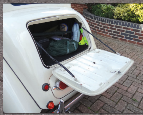
Boot lid doubles up as a seat