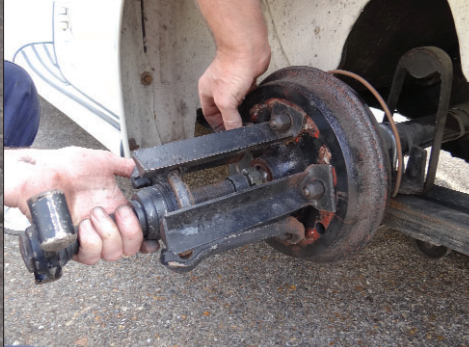
Five point puller needed to remove the rear hubs