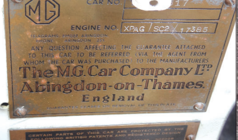
Abingdon manufacturing plate