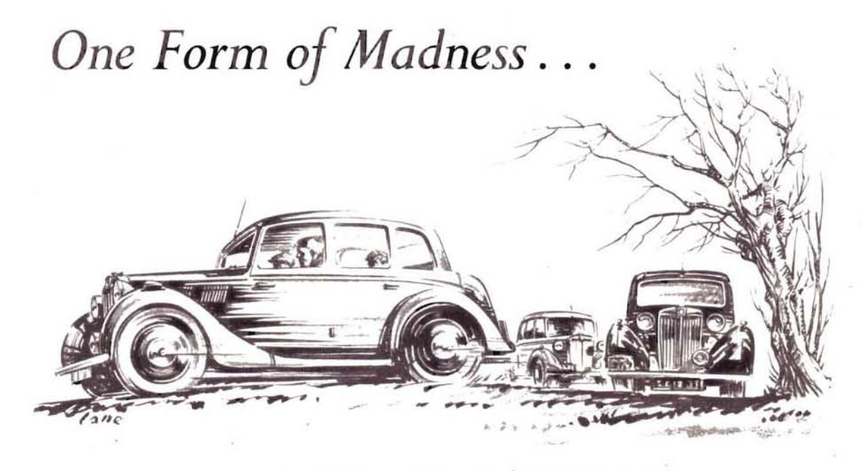
... or, the Lighter Side of an M.C.C. Rally

JEXT Wednesday, November 12, sees the start of the Motor Cycling Club's National Rally for motorcars, the 1,200-mile road section of which ends at Brighton 48 hours later. This account is of last year's event which finished at Hastings.