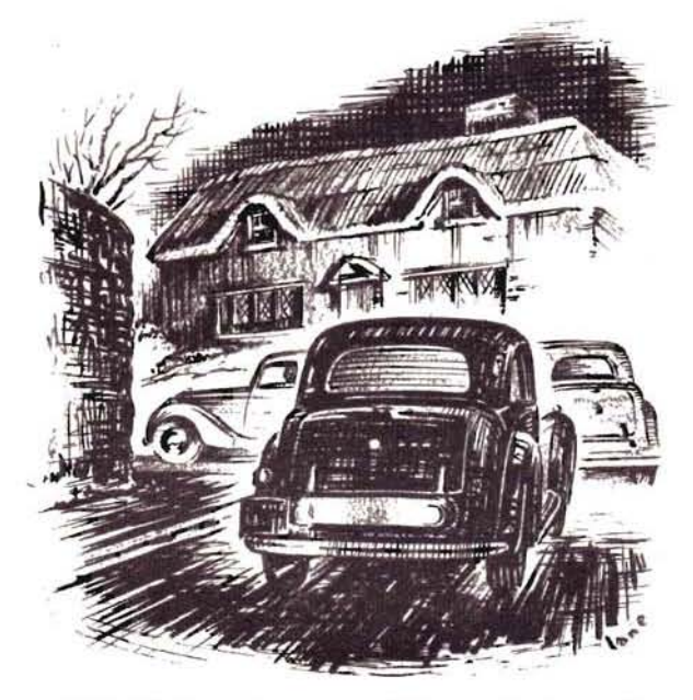
"Olde Worlde cottages appeared disconcertingly. . . . ."

Needless to say, the finishing line was passed the second time with about 6,000 revs up. At least, that's what it felt like. The second part of the test was up a gradient which would have put the Forclaz to shame. At the top of it,