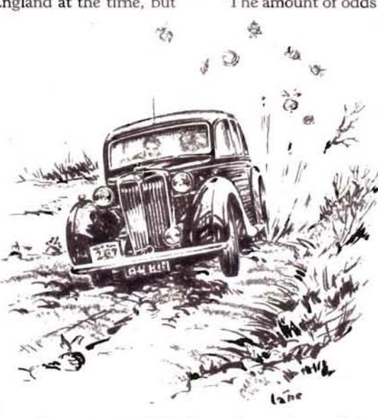
. . among a field of mangel-wurzels. . . . "

At Gloucester, Caleb Griffiths's organizing genius was apparent. The three cars stopped as prearranged in front of an hotel; food for eight was already on the table, inside 20 minutes we were outside an excellent luncheon, and back on the road. If this is the form, I thought, nothing can hold us back.