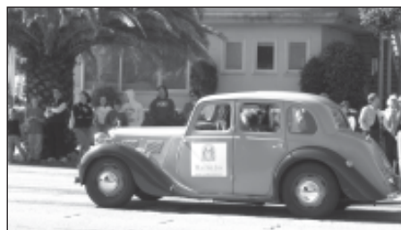
Cars from the collection regularly appear in local parades.