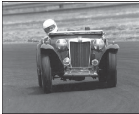
Above left: 1948 MG TC at Laguna Seca – supercharged, four-cylinder push rod, 1.5 litre, four-speed transmission, dunlop 16-inch racing wheels, Alfin drum brakes, 10,000 made. Above right: 1936 MG, NB Magnette Special Roadster – six-cylinder overhead cam, 1.5 litre, supercharged, Wilson preselector trans, airplane hydraulic front brakes, West Coast racer. One only.