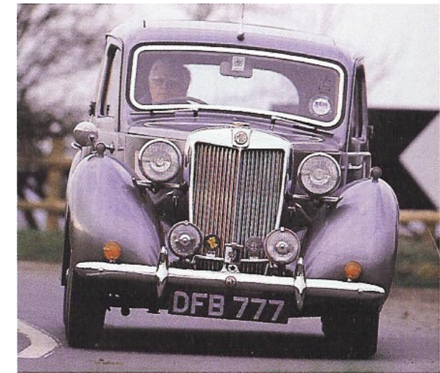
Anti-roll bar on the front allows for a bit of spirited cornering.