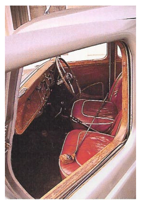
Interior space is at a premium, but all the trimmings are of suitable quality. confides. 'You know Rawlinson, all wind and wallop. Tees off at the 16th with a wood instead of a five-iron like the rest of us. It went long and wide, straight into the carpark, then

there's a sound like a ring on a cracked bell and the blessed ball comes back over the hedge, across the green and straight clown the hole. I'm sure it broke about three rules, but we had to let him have it, for the novelty if nothing else. You won't tell a soul, of course.'