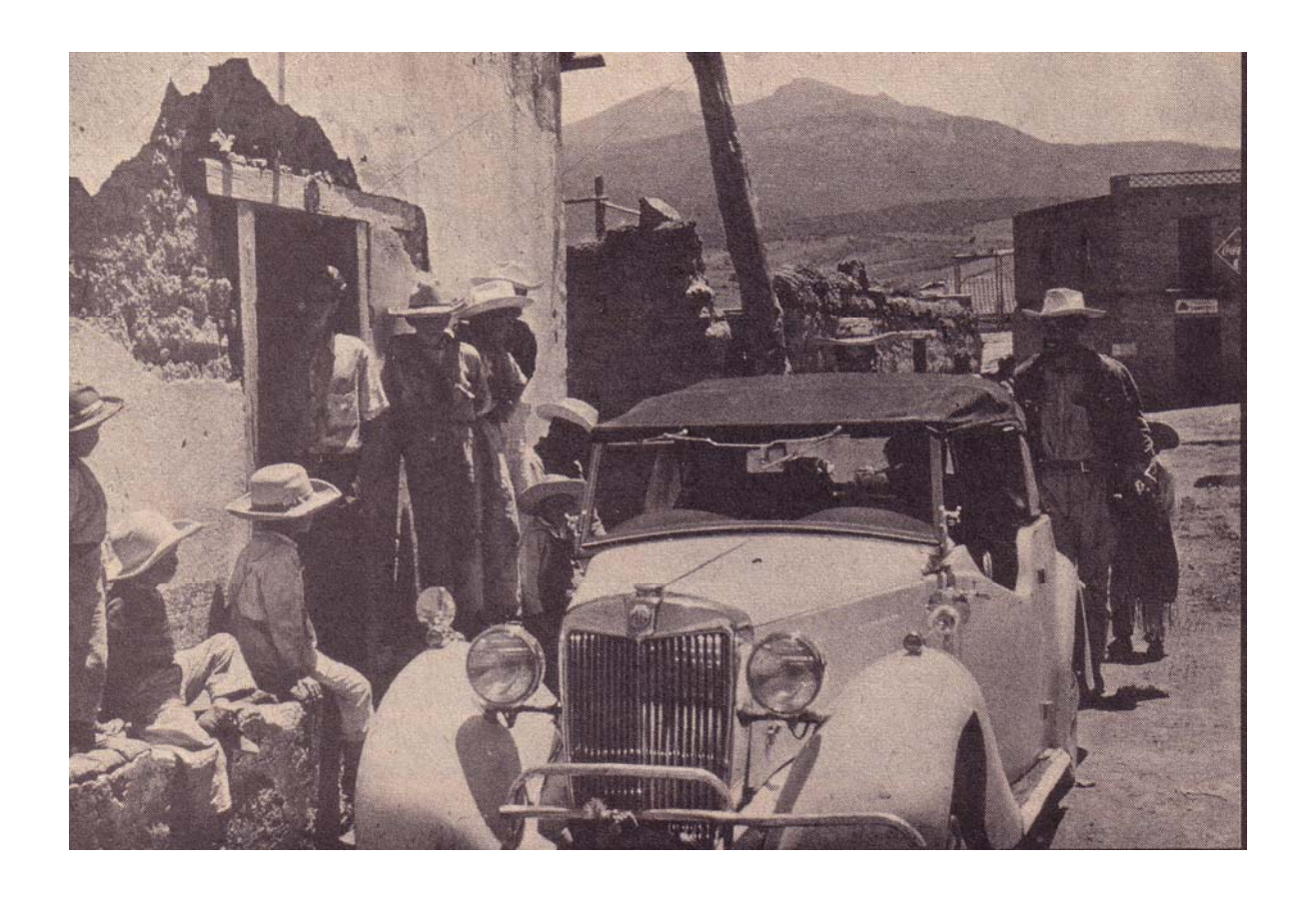
The very first MG to scale the slopes of Nevada de Toluca – and a conference by the local populace to