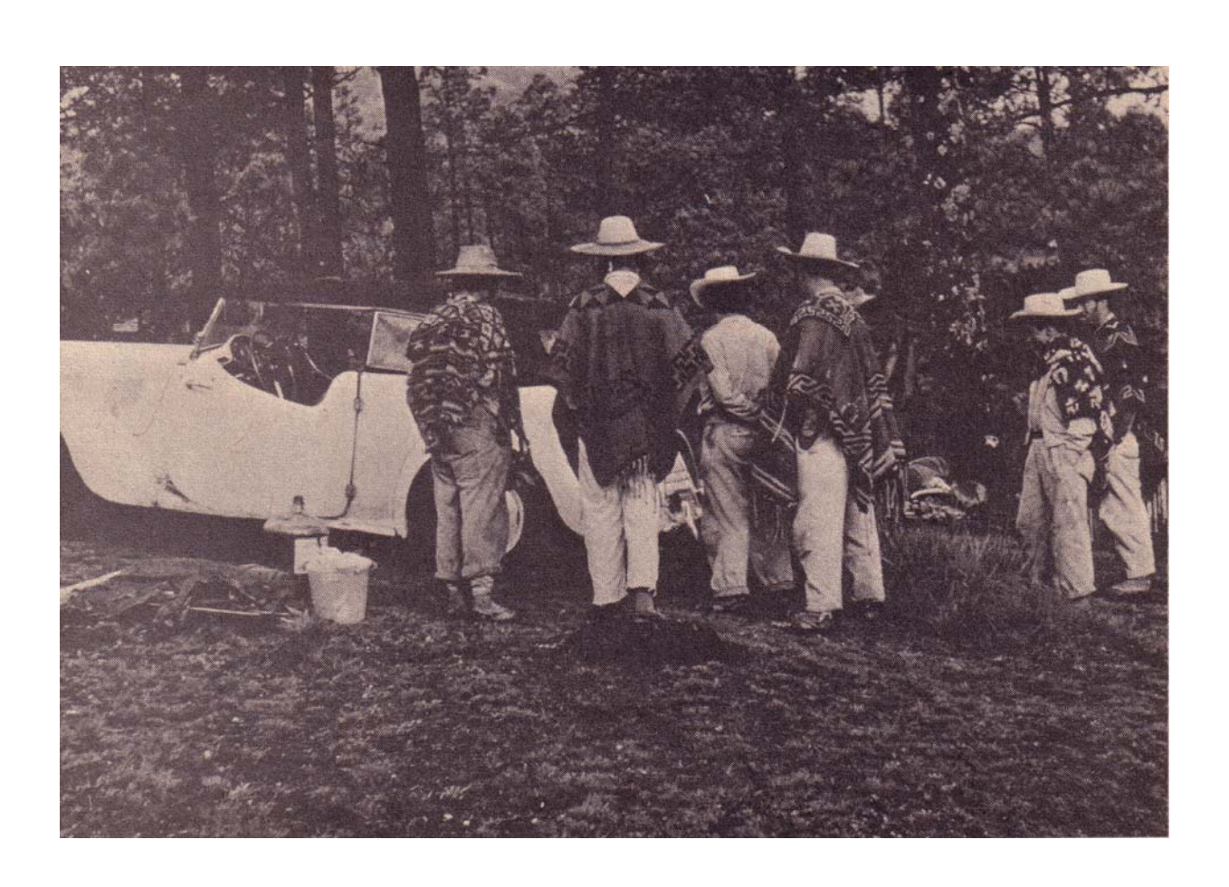
decide how to dismantle and reroute this apparent messenger from the heavens.