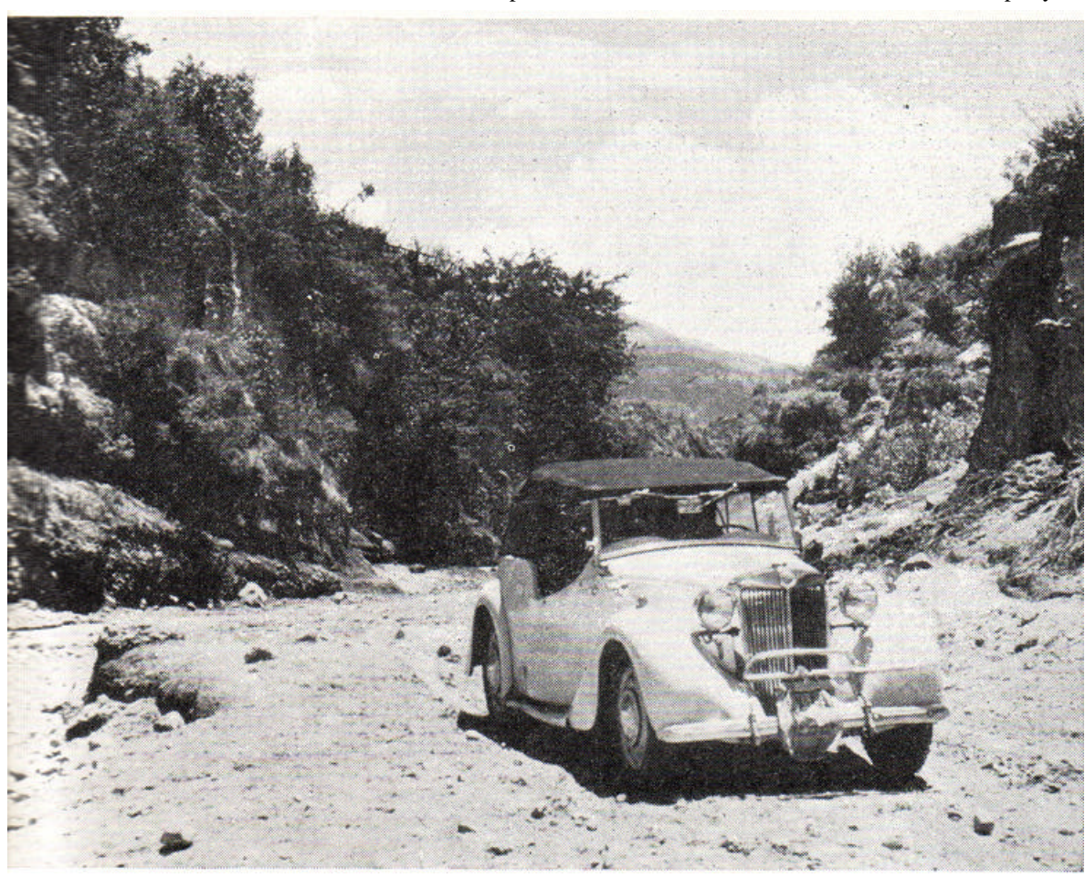
This was easy stuff: after their adventures on the mountainside, the trio (plus Pepi) had a nice dry river bed to take them towards Zaragosa.

A steep incline sloped to the shores of the lake, and we made the descent running, jumping and sliding in the soft lava ash. A roofless dwelling and metal crosses with inscriptions gave evidence of former habitation. Barrenness and silence engulfed us; not even the cry of a bird interrupted. It was an eerie place and we skirted the lake rapidly. As