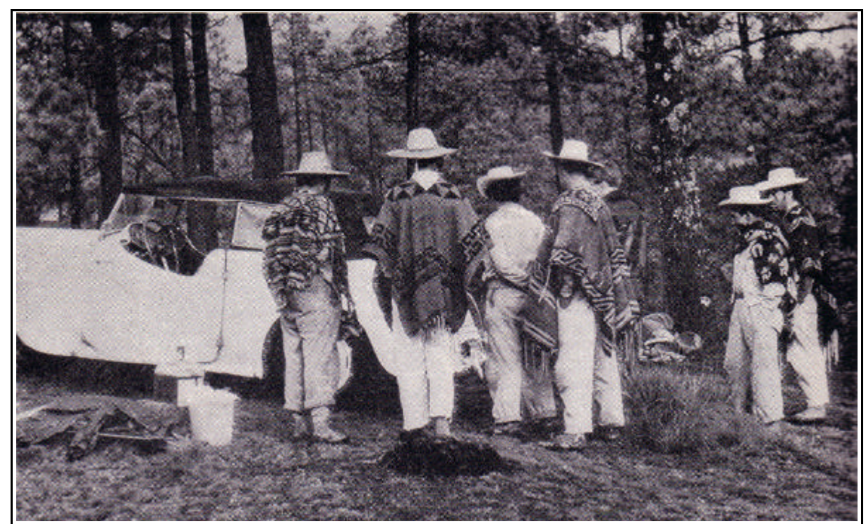
The very first M.G. to scale the slopes of Nevada de Toluca – and a conference to decide how to dismantle and reroute this apparent messenger from the heavens.

we were ready to leave we met three Indians walking along a circular track leading into the crater. We exchanged greetings: