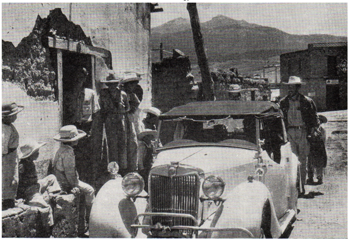
Back in comparative civilisation, the M.G. draws up at Zaragosa's only shop for refreshments. Pepi (on the right) is all smiles, but the twin peaks of Nevada de Toluca tower sternly in the background

'From here', Pepi assured us 'we can all come aboard.' We followed a dried-out river bed with