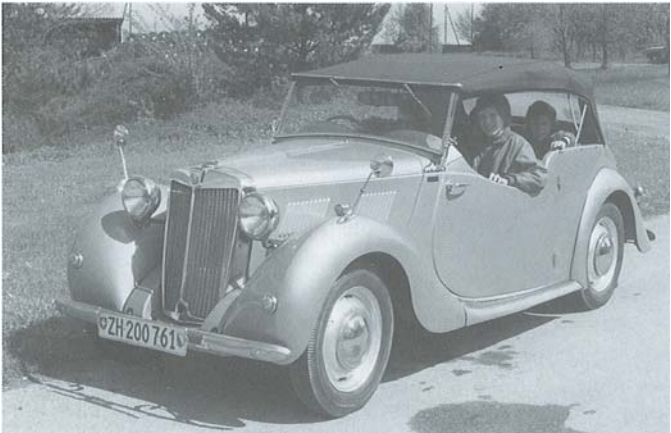
First outing with the newly restored and re-sprayed YT in the spring of 1977 after successfully passing the Swiss MOT.

I felt like a traitor when I finally advertised the car for sale in "SignPost". Several interested parties contacted me but one didn't have enough money, the second one didn't like the look of it, (he'd expected something more like a the TD.) and the third one, the third gear kept jumping out during the test drive made by this critical prospective purchaser (I swore that I would never again allow an inexperienced person, with the whims of an oldtimer, behind the wheel of an old car!)