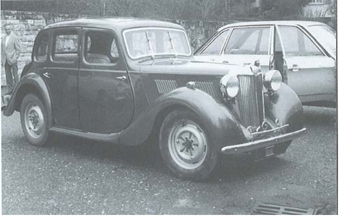
"Starting point" photograph of a YA which I looked at in 1975. On the right was my everyday car, which was also a 'classic' and was the VW K70, an adaption of the NSU design.

Checks carried out by a bodywork expert confirmed my worst fears. My acquisition stayed in the workshop for a 'ground up' restoration followed by a respray in very nearly the original lime-green metallic colour. Luckily all this work was carried out as 'fill up work' so that I avoided having to pay the full hourly rate. This was followed by preparation for its MOT by a car mechanic.