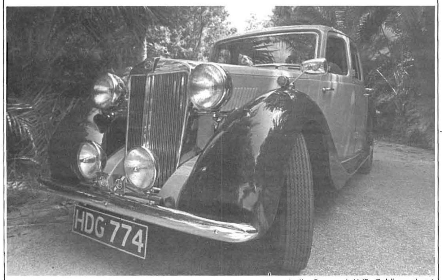
Jim Bowman's Y

overhead valve system could work correctly. The new model was called the TB, which had nothing to do with a popular illness of the time, and pre-dated the Hitler conflict by a few short months. When the war started, TB production stopped until 1945 when the same vehicle, with minor cosmetic changes, was introduced as the TC. Even though the 1.25 litre engine had been bored and de-stroked in 1939, it was still undersquare at 66.5 x 90 mm. On a clear day the TC engine would run to 5200 rpm when it would generate some 40.6 kW (54.4 bhp).