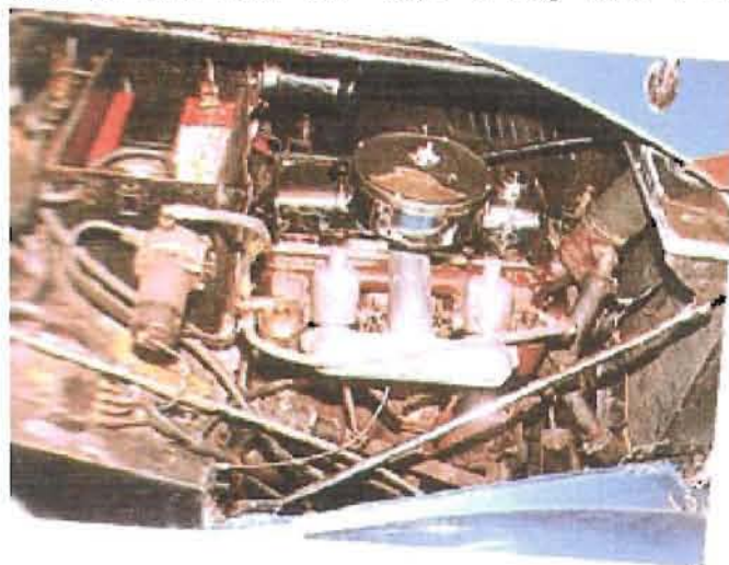
Engine before restoration