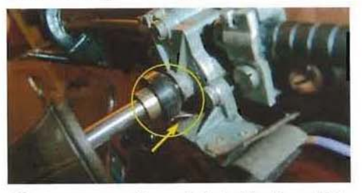
Here we can see the conic bakelite ring which (in pressed-in position) opened the contact tongue of the switch