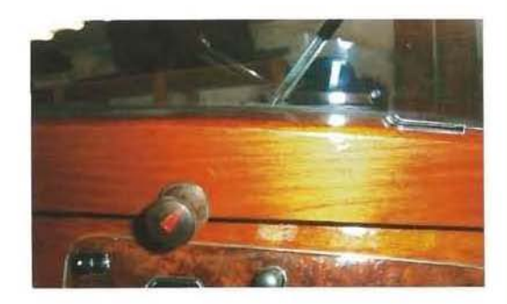
I marked the parking knobs to screw the wiper arms tight in the correct position