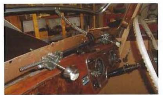
The wiper arrangement with driving links (wheel boxes) and the push and draw cable.