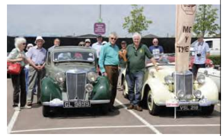
Relay Baton reaches Gloucester during June