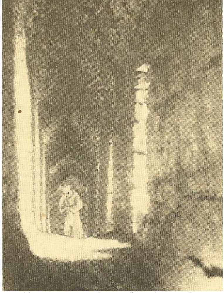
"A narrow tunnel, steeply descending"—the commodore supplies the ghost effect.

After that, of course, it was easy to locate ourselves and the error, and we studied the situation as it applied to the about-turn of the low-slung Riley (whose lock is by no means exceptional). An attempt was made about a hundred