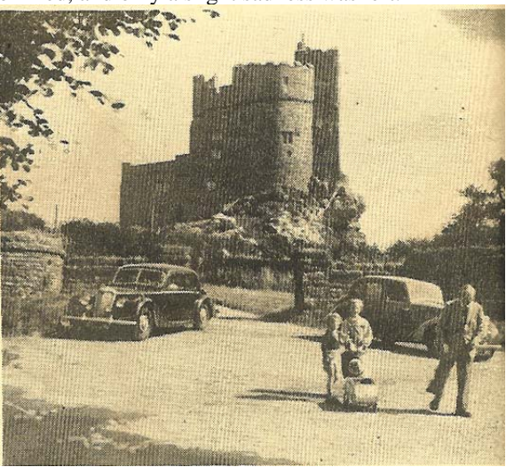
"Roch, with its fuchsia-topped walls . . . was the complete contrast."

Dispersals were always like that. A flag fluttered, a convoy atomized, and only a slight sadness was left.