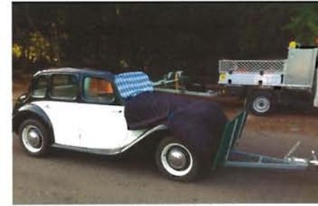
Gavin's A-Frame in action

Sunday morning’s first 21 mile drive took the Y’s to their first stop at the Blackall Range Horseless Carriage Club in Maleny, where the Club’s members had a display of their vehicles and put on a very large spread of sandwiches, cakes and other treats for our morning tea.