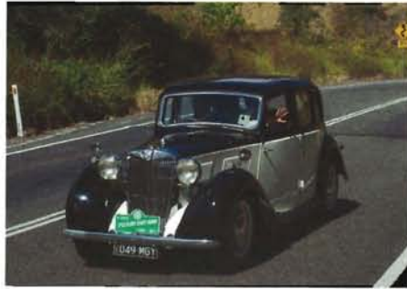
Gavin & Rayleen in YA3530

Straight after lunch at Palmwoods, the convoy headed to a secret location where the now 33 Y-Types formed a large “Y” for the official event photo of the weekend. Our 34th Y-Type, a Tourer, failed to make it to Nambour and was returned to the Gold Coast for a rest and new expansion plug! It was quite an experience, lining up all the cars, matching colours where possible and getting all the crews in place – but boy oh boy, it was worth it.