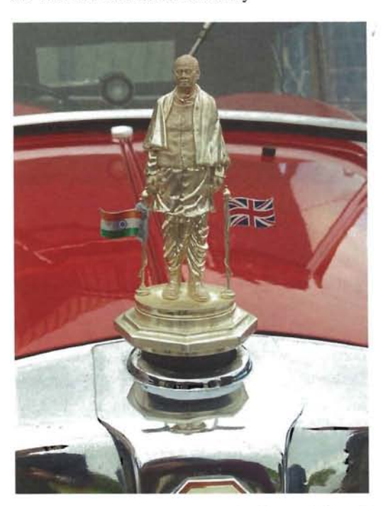
The Octagon Bulletin 7