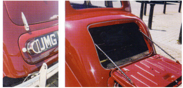
Clever boot arrangement. Wonder when it will be re-invented?