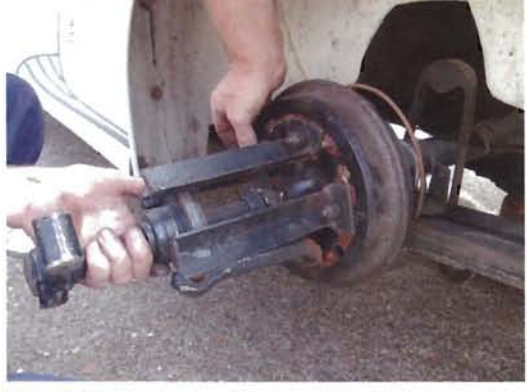
Drive shaft breakages are said to be common; needs a puller too