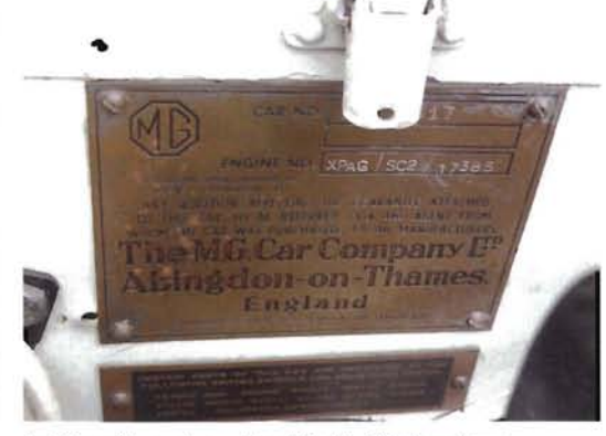
Detailing still remains such as this identification plaque