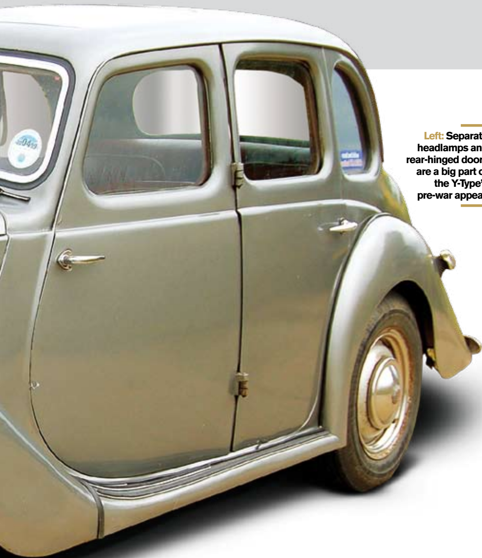
Left: Separate headlamps and rear-hinged doors are a big part of the Y-Type's pre-war appeal.