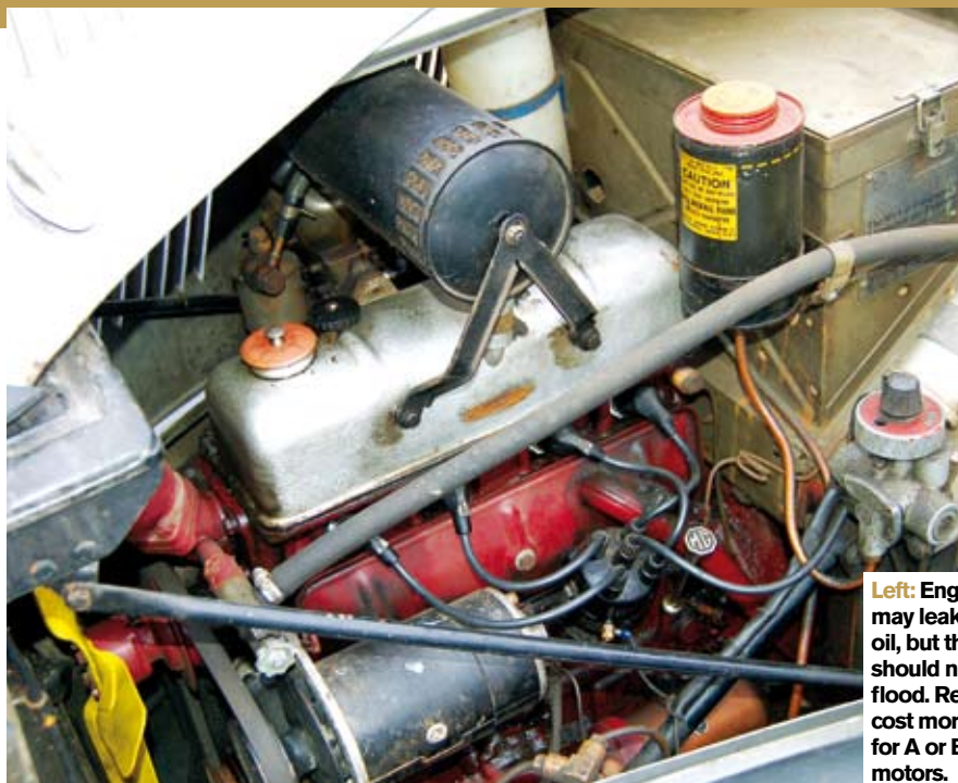
Left: Engines may leak a little oil, but this should not be a flood. Rebuilds cost more than for A or B-series motors.

Gearboxes should be pretty quiet, except in first and reverse, and shouldn't leak oil. Go up and down the 'box a few times to see if there's much synchromesh wear, and lift off in each gear to see if the lever jumps out. Rear axles may whine at higher speeds, which is often accompanied by a buzzing from the gear lever. However, if this buzzing is there without any axle whine, it suggests worn gearbox bearings.