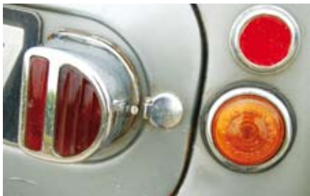
Above: The rear number plate panel is removable for access to the spare wheel.

use rather than motorway journeys, and on that point the long-stroke engine design means they don't appreciate cruising at over 55mph for any length of time. To do so is to invite accelerated wear to the bores and piston rings, so get used to the idea of planning journeys for entertainment and scenery rather than slog.