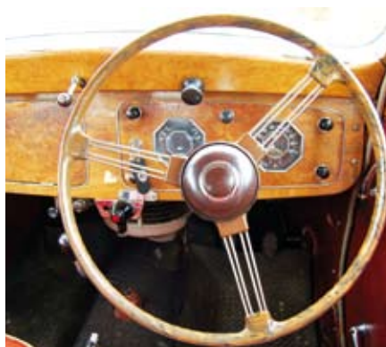
Above: Unusual dash uses octagonal clocks. Handle in middle is to open up the windscreen.

"Considering what they offer, £6500 represents something of a bargain"