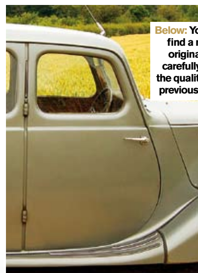
Below: You won't find a rust-free original car, so carefully assess the quality of any previous repairs.

The following checks all need making so you at least know what you are getting into, and can avoid a car that's bad in an area that you don't want to get involved with. But your findings must be tempered by the fact that you aren't going to find a lot of Y-Types to choose from. There are rarely more than a couple for sale thanks to rarity and owners tending to hang onto them, which should tell you something in itself.