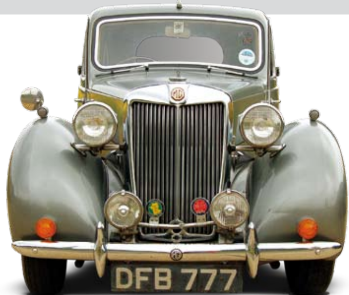
Left: Flashing indicators on upright and imposing nose are later additions. Below: Rear is more flowing. Over-riders were an option on the YB and are dear.