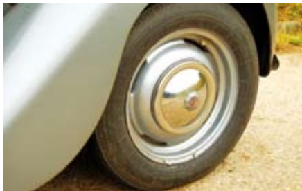
Above: YAs sat on 16in wheels, YBs on 16in items. Both, of course, wore crossply tyres.