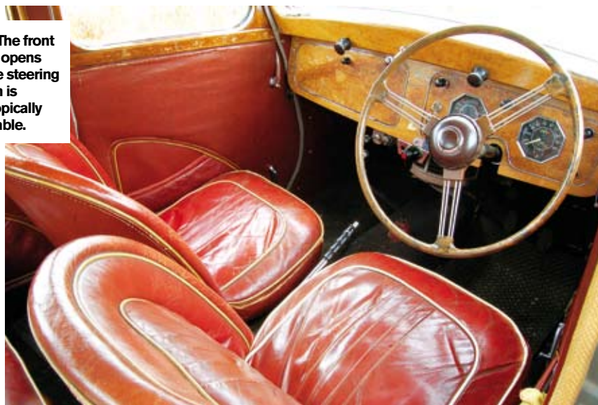
Right: The front screen opens and the steering column is telescopically adjustable.

There has long been a problem with cracked steering wheels, but these have recently been reproduced, so scruffy ones can at least be replaced, albeit at a cost of £178.