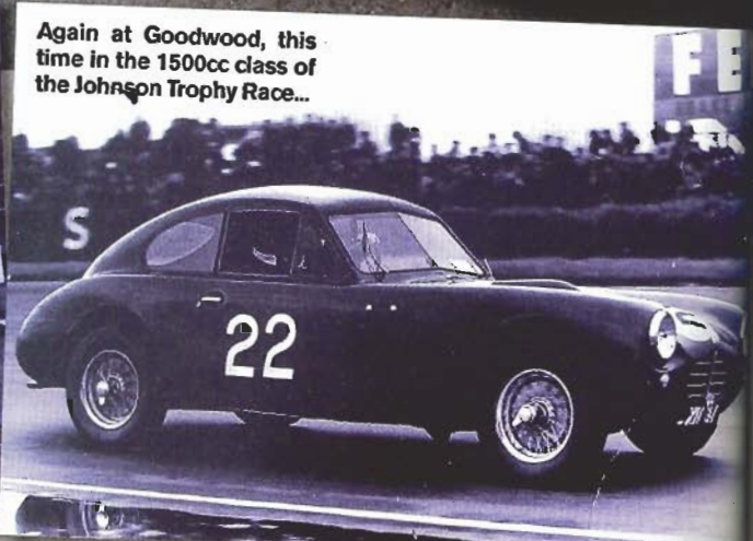
Again at Goodwood, this time in the 1500cc class of the Johnson Trophy Race...