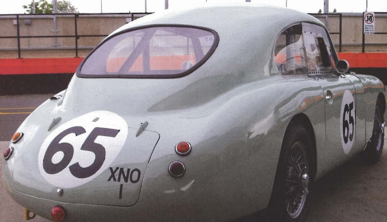
Above: Original XNO 1 number is there for show after registration was transferred to a Volvo some time in the past.