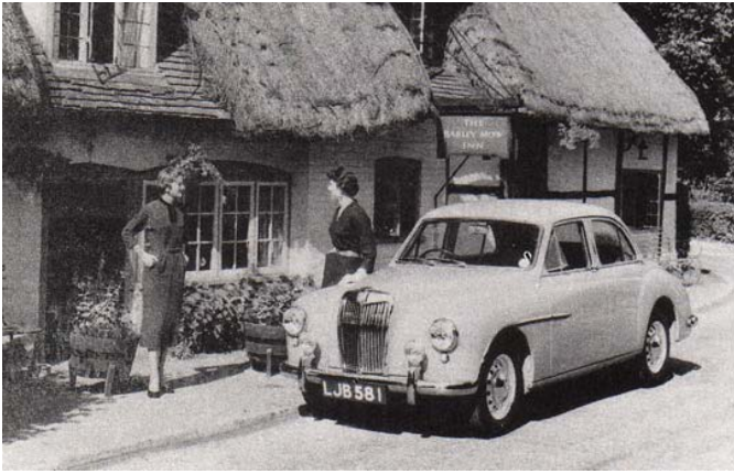
The Z Type saloon was a popular successor to the Y Type. Today, these sleek cars are prized by collectors.

But the success of the TC in America suggested to Nuffield that the Y-Type might find more of a niche in America if offered in a somewhat more sporty, open model. Thus the Y-Type Tourer, or YT model, was announced in early October, 1948 expressly for the export market. Aside from the obvious body changes, the Tourer differed in several other significant ways from the Y-Type Sedan. The most apparent was a conversion to left-hand drive. Changes under the hood included the relocation of the battery to a more central location on the bulkhead and use of a modified oil pump to allow for the repositioning of the steering column.