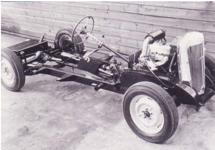
The Y Type chassis was substantially more robust than the previous TC's. This frame became the basis for the TD, TF, and MGA.

The Y-Type frame (which was to serve as the basis for the yet-to-be M.G. TD, TF and A models) was constructed of box section, light gauge steel side rails connected by tubular cross-bars. It was, as expected of a