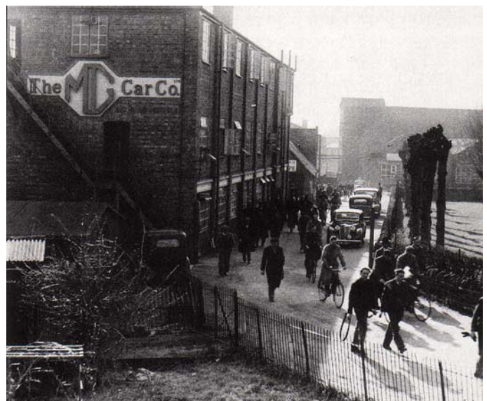
In the immediate post-war years, not many M.G. factory workers were able to drive home in a new Y Type. This is the Cemetery Road entrance to the works with the administration building on the left.

This came to pass at the 1953 London Motor Show where the Z Type M.G. Magnette sedan was introduced. Bearing one of the most famous names in M.G. history, the Magnette, with its modern lines and unit-body construction brought the curtain down on the era of the Y-Type M.G.s.