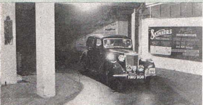
Reg Holt (M.G. 1 1/4 litre) swings down into the underground car park at Hastings, at the end of the long road section.