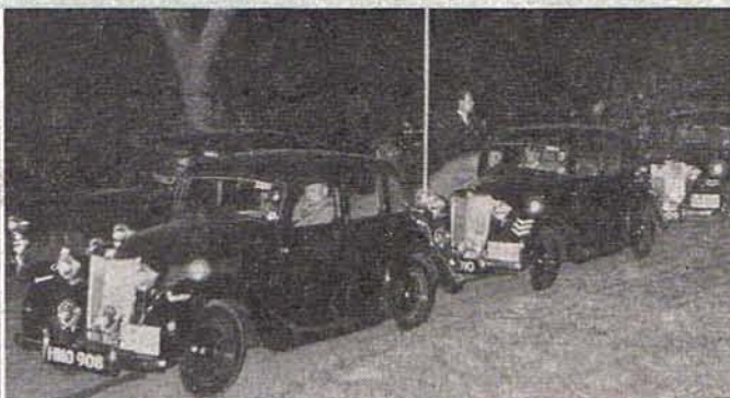
The same three cars as on the left lined up in a different order at the Prescott test, held on the earlier stages of the famous hill.