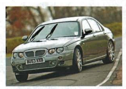
V8 version of the ZT got rear-wheel drive...

For more advice, you know where to look: www.mgcc.co.uk and www. mgownersclub.co.uk.