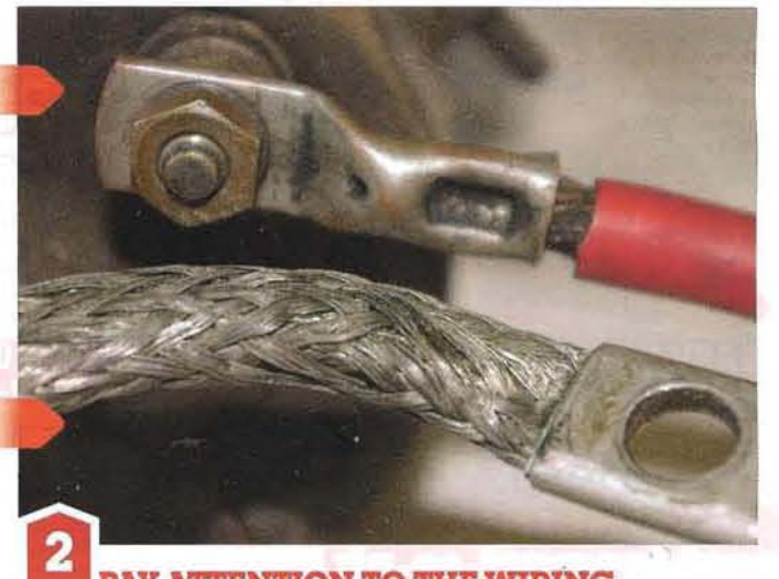
Fractured, frayed or corroded wiring will impede the flow of power and hamper the starter's performance, as will loose, corroded or dirty connections. Check them regularly. Battery terminals and contacts can be weather-proofed with Vaseline or copper grease.

The ignition key switch activates the solenoid, which connects the battery to the starter motor. The solenoid control is earthed through the bodywork. The motor is earthed via the engine, so check the return cables from engine to bodywork and from bodywork to the battery.