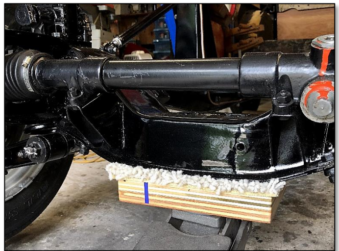
LIFTING @ FRONT CROSS MEMBER