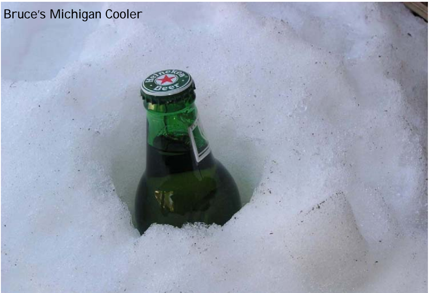
Bruce's Michigan Cooler

Only $27.00, which includes the shipping cost.