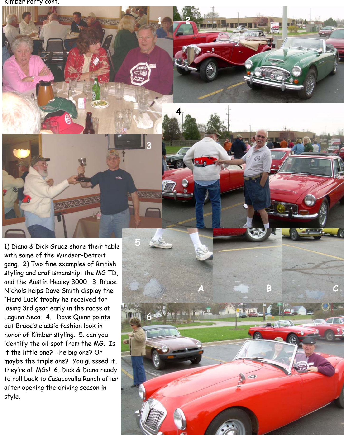
A-Antics Page 8