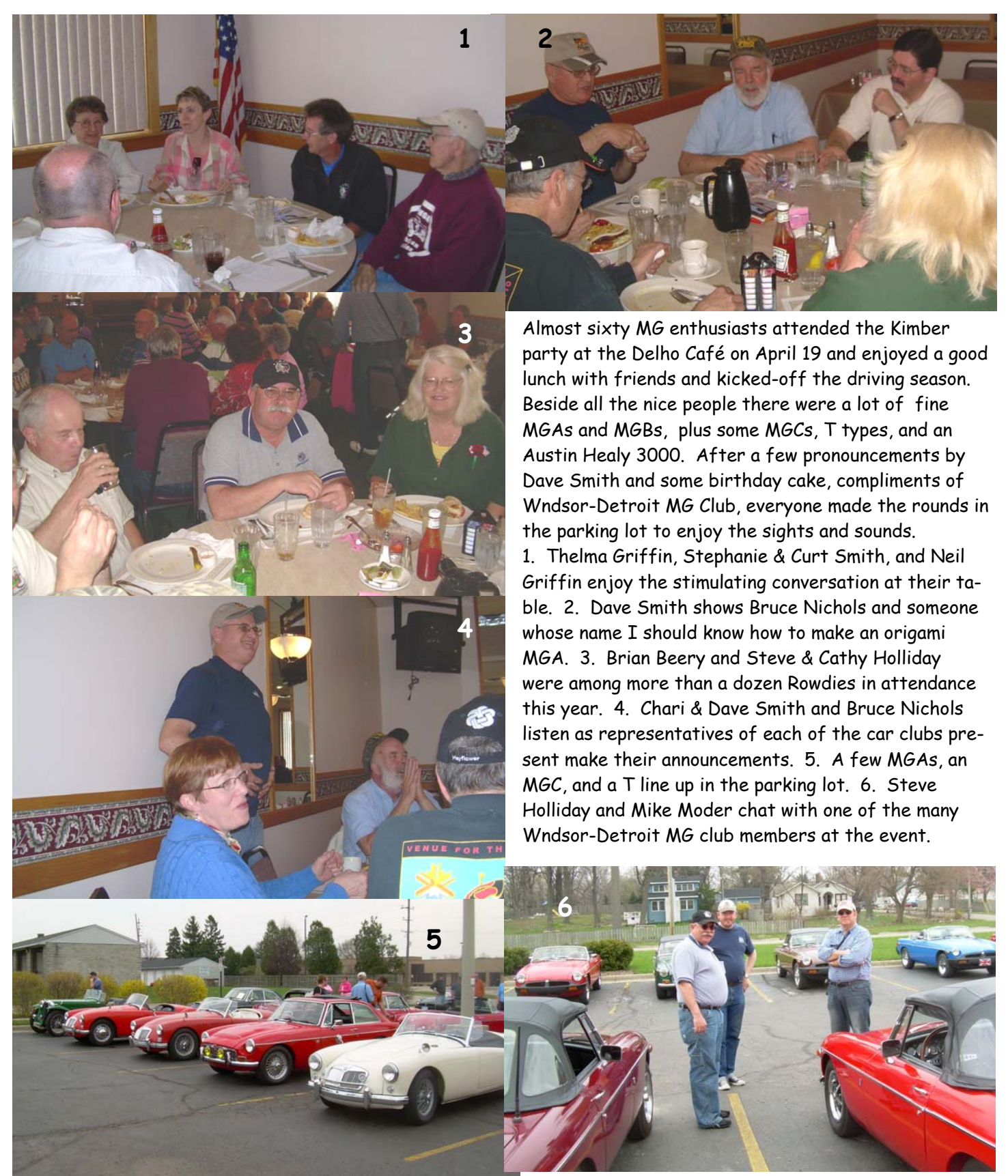
A-Antics Page 7