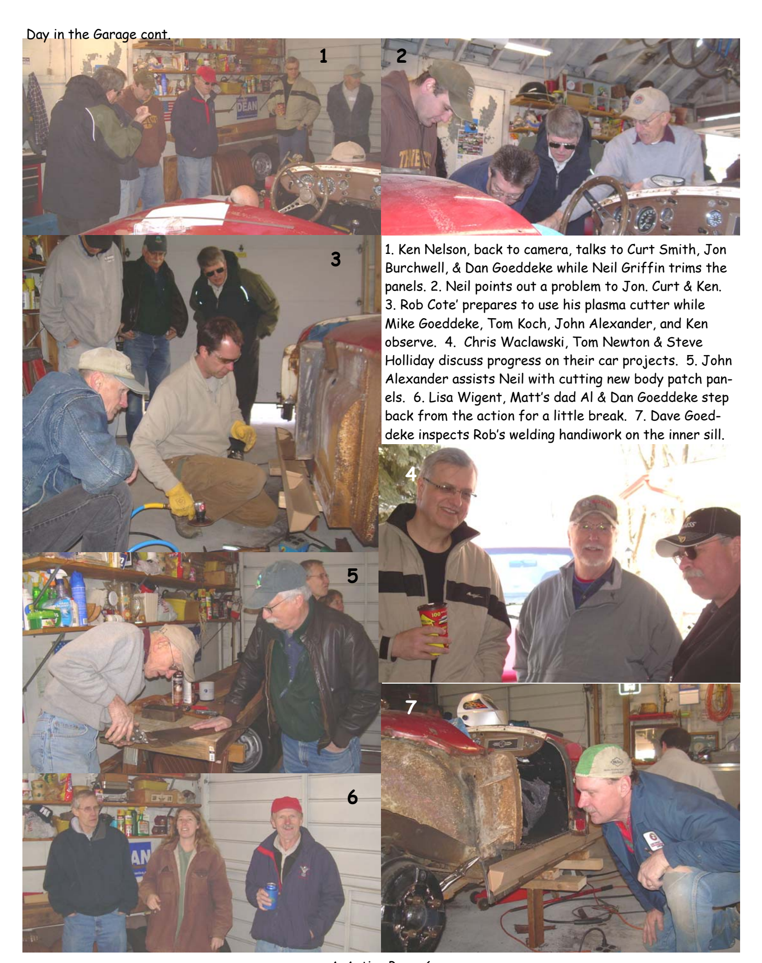
A-Antics Page 6