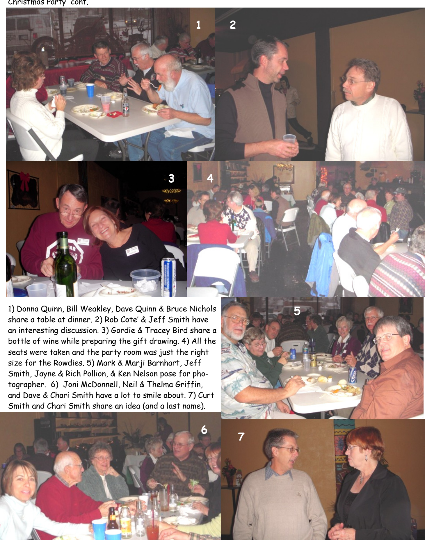
A-Antics Page 7