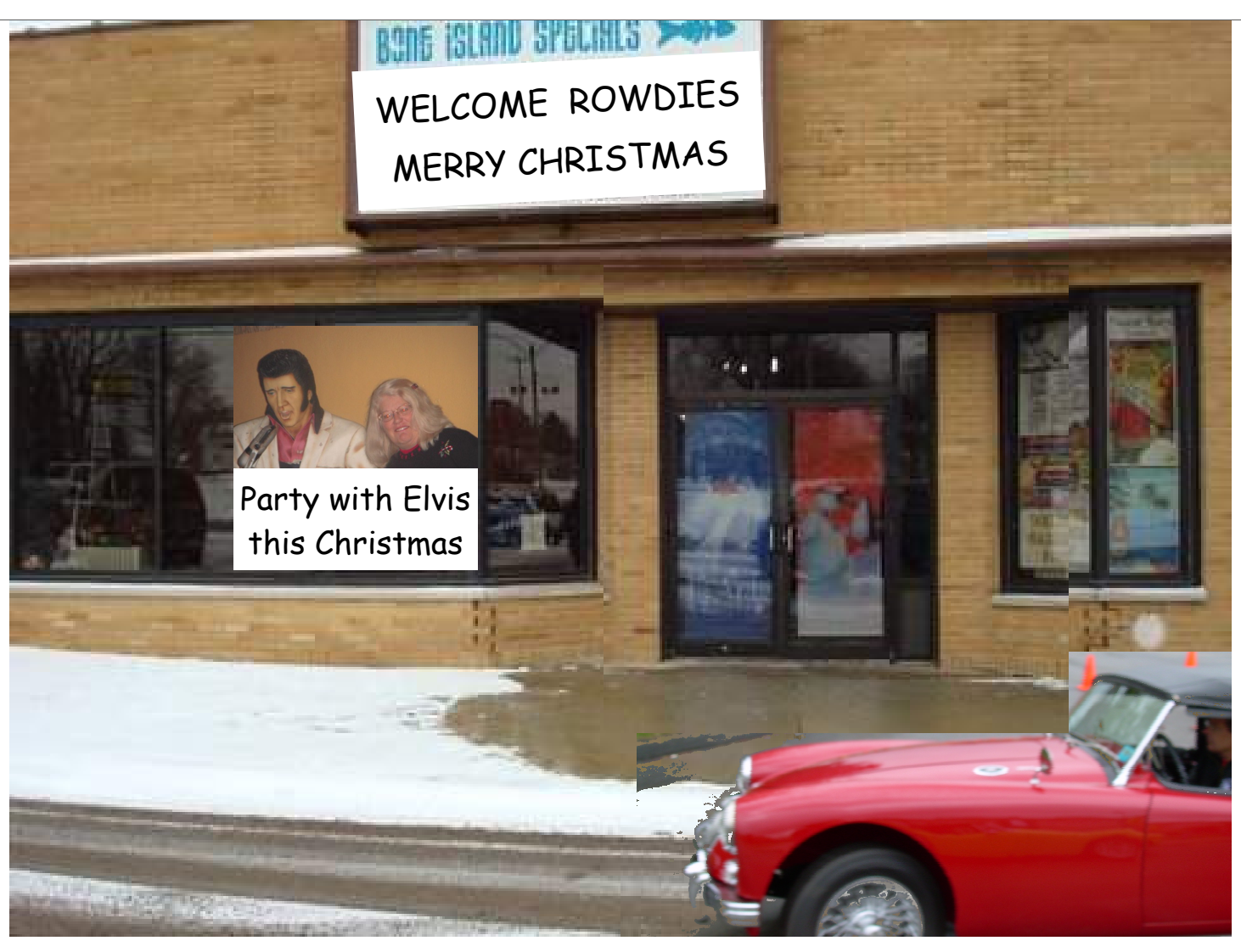
Inside; Christmas Party Photos Rowdies Business Meeting, Feb. 7, 2009 It's time to elect new officers!