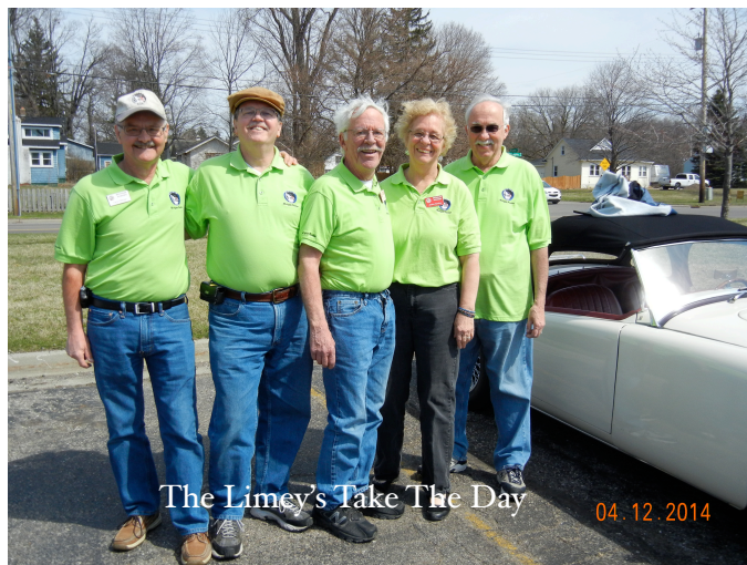
The Limey's Take The Day