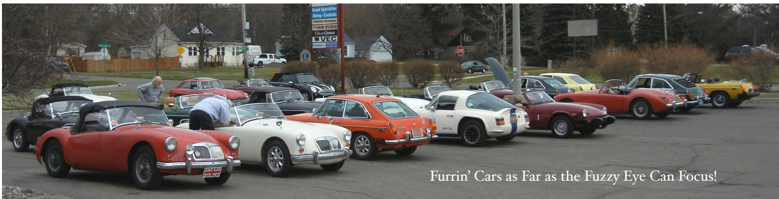
Furrin' Cars as Far as the Fuzzy Eye Can Focus!