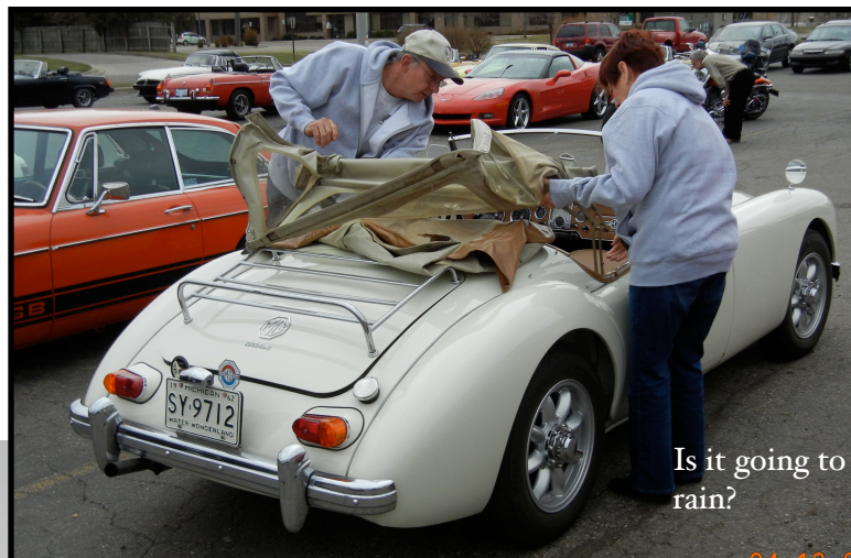
Is it going to rain?