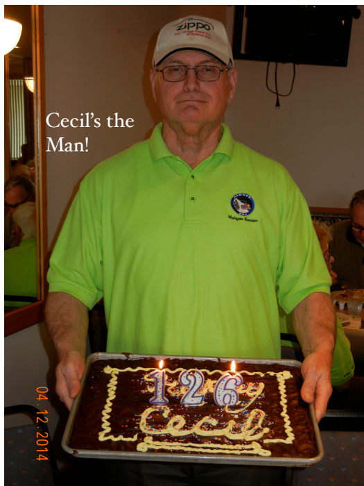
Cecil's the Man!