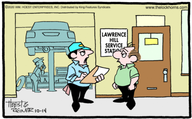
"IT'S GOT HIGH TIRE PRESSURE, STIFFNESS IN THE BALL JOINTS AND HARDENING OF THE ENGINE HOSES."