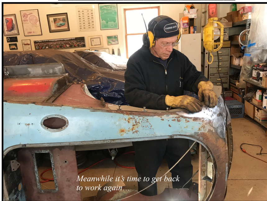
Meanwhile it's time to get back to work again...