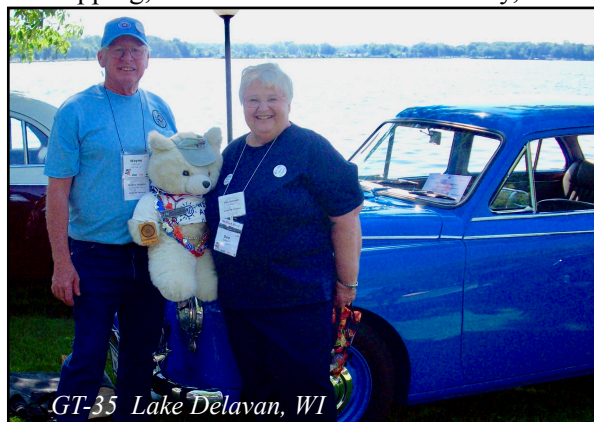
GT-35 Lake Delavan, WI

After sorting out the MGA's endless issues that spring we took the ferry across the lake. Departing the ferry the car balked and stalled. I was able to force it into a lower gear. We then drove 20 miles south of Milwaukee in 3rd gear to get us out of the inner city. Upon stopping, the transmission was bone dry, locked in